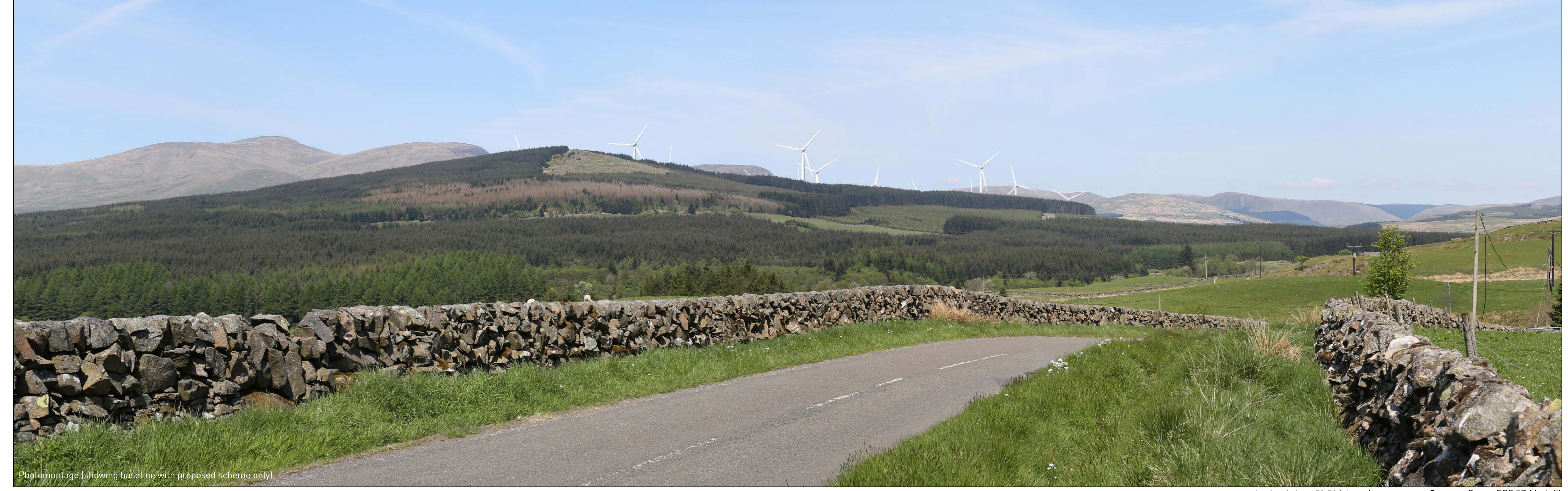
Figure 8.47 (sheet C) Viewpoint 11: B7000 north of East Arndarroch SHEPHERDS' RIG WIND FARM